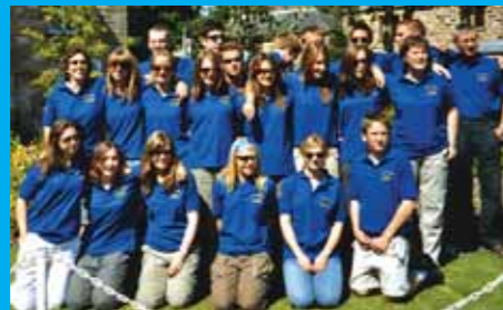
Ashville College Students

21 Ashville College students have recently returned from a 3 week expedition. During their stay they helped out in the Infant Home feeding the babies and teaching in the nursery school. They painted a school, helped build a feeding station and dug a latrine! We are very proud that our youngest daughter had the opportunity to contribute to this worthwhile cause.